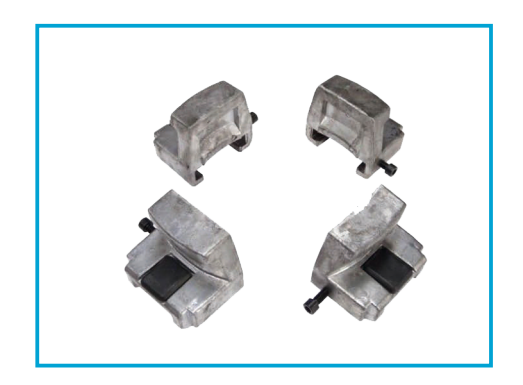
4X PADS FOR THE JAWS FOR ALUMINUM RIMS (OPTIONAL)