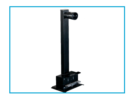
MOBILE WIRED CONTROL UNIT