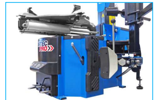
Strong bead breaker with a force of 3 tons