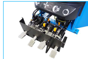
Extendable cassette with pedals