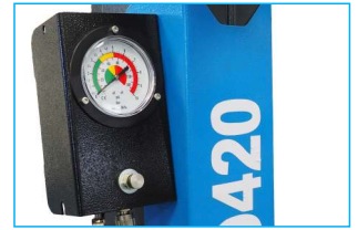
Metal box with pressure gauge