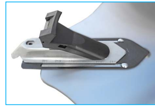
Additional jaws slides, and the inflator nozzles