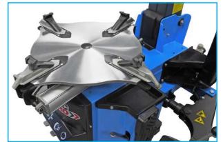
Profiled assembly table from 10 "to 24"