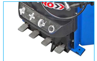
Double speed rotary table, controlled in the pedal